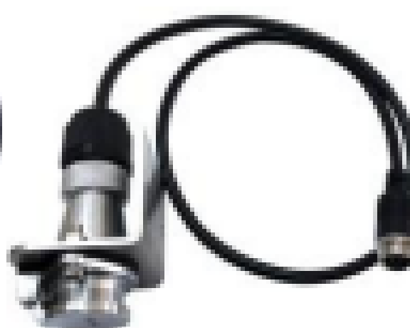
Heavy Duty Connector & Bracket