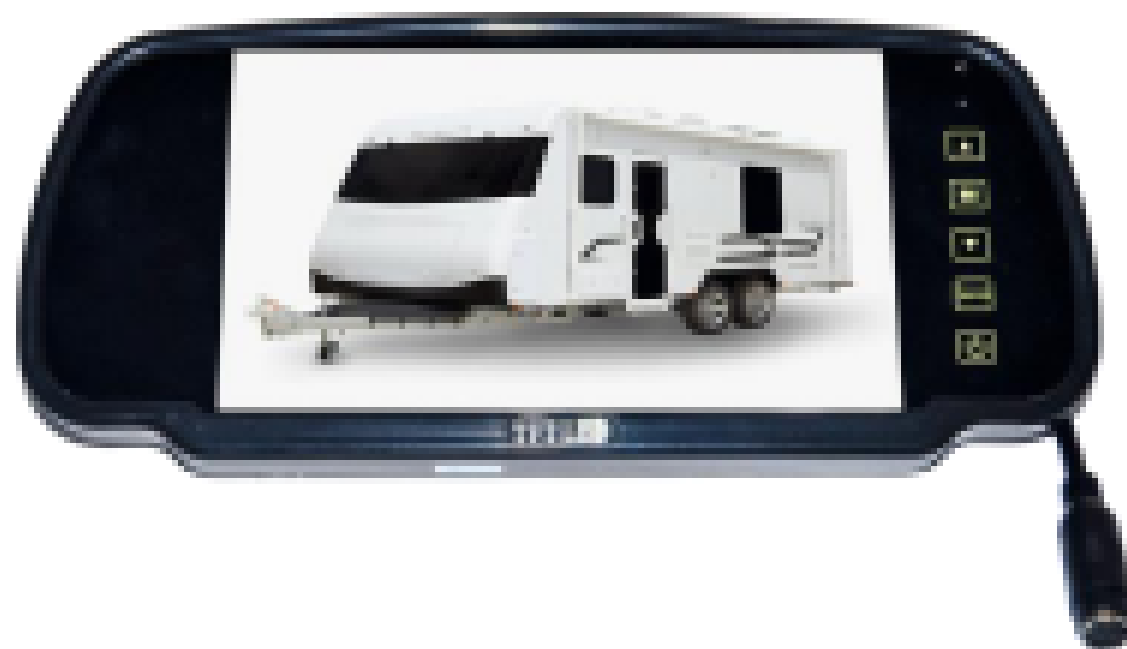
7inch Rear View Mirror Mount Monitor