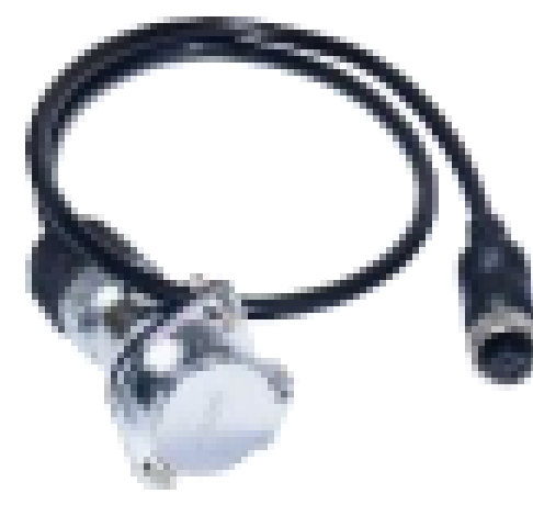
Heavy Duty connector