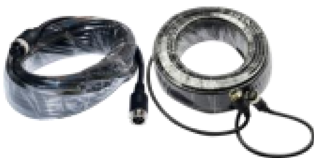
6M /20 Extension Cable